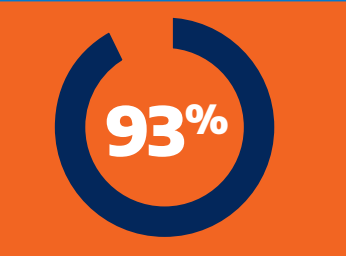
MDLIVE Dermatology patients had their issue resolved during their first consultation .